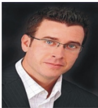
Authorised FSP 15422